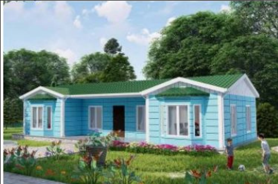
AYGNC VILLA 95