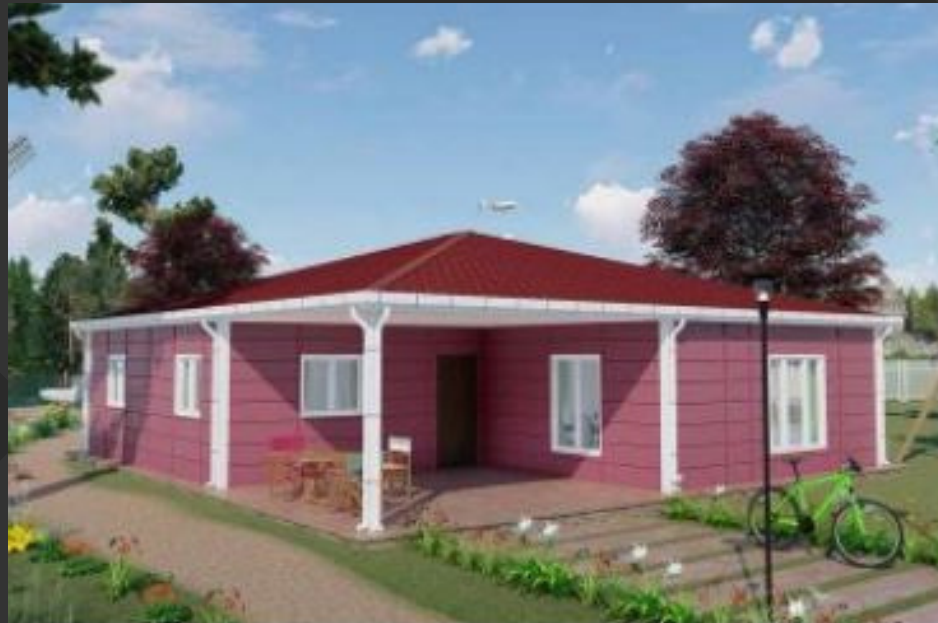
AYGNC DUPLEX 123

103 m 2 • 3+1 • Galvanized Steel Frame • Fireproof Wall Panels • Thermal & Acoustic Insulation • Sloped Roof Design • Double-Glazed PVC Windows • Decorative Exterior Finish