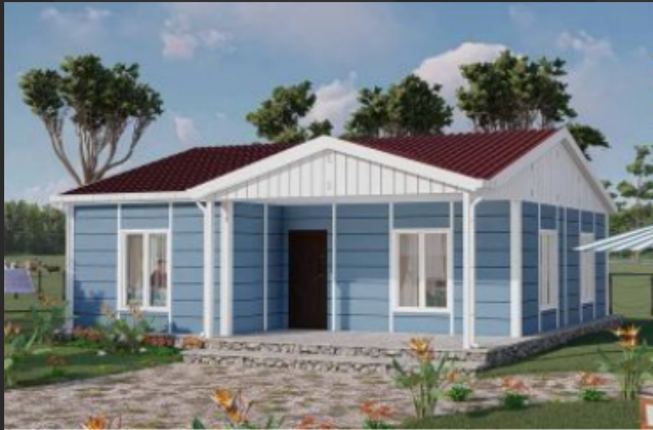
AYGNC ELITE 83