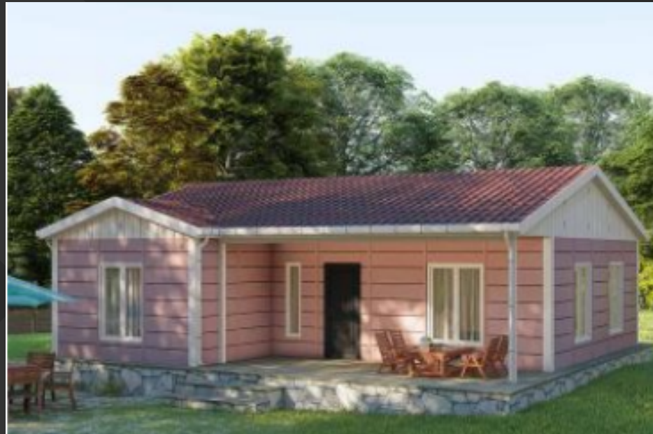
AYGNC GRAND 87

83 m 2 • 3+1 • Steel Frame • Thermal + Acoustic Insulation • PVC Double Windows