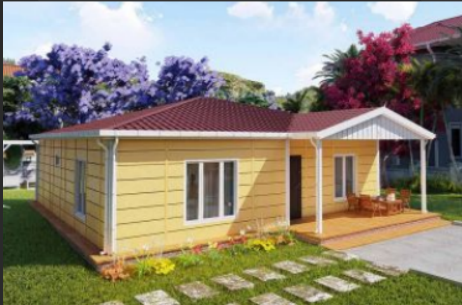
AYGNC PRESTIGE 103