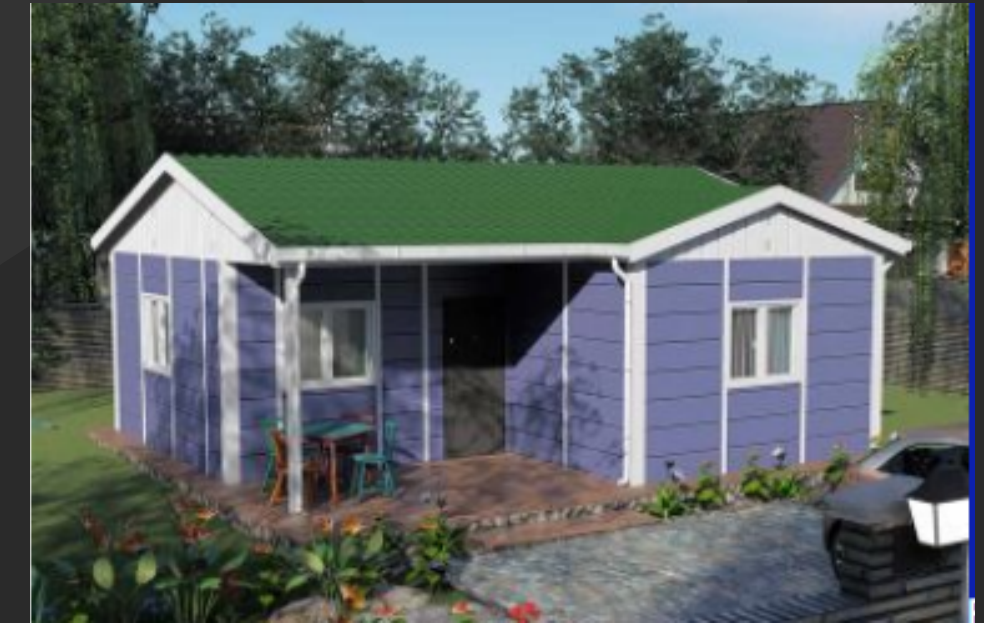
AYGNC MODERN 51

45 m 2 • 2 Bedrooms • Steel Frame • 13 cm Wall Panels • Modern Roof • Double- Glazed Windows