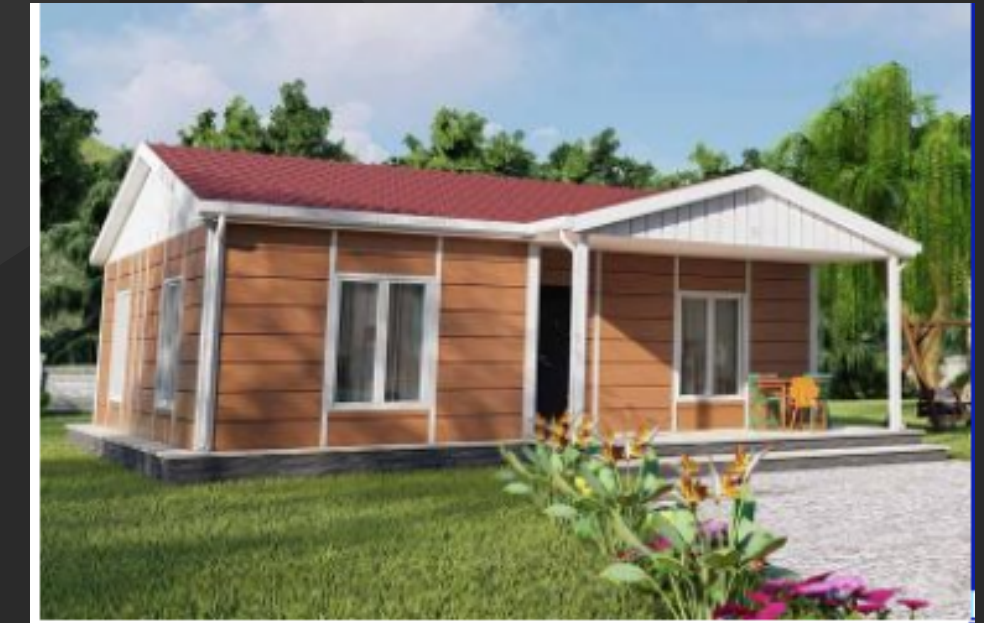
AYGNC STYLE 75

73 m 2 • 3+1 • 13 cm Wall Thickness • Reinforced Roof • Insulated Doors & Windows