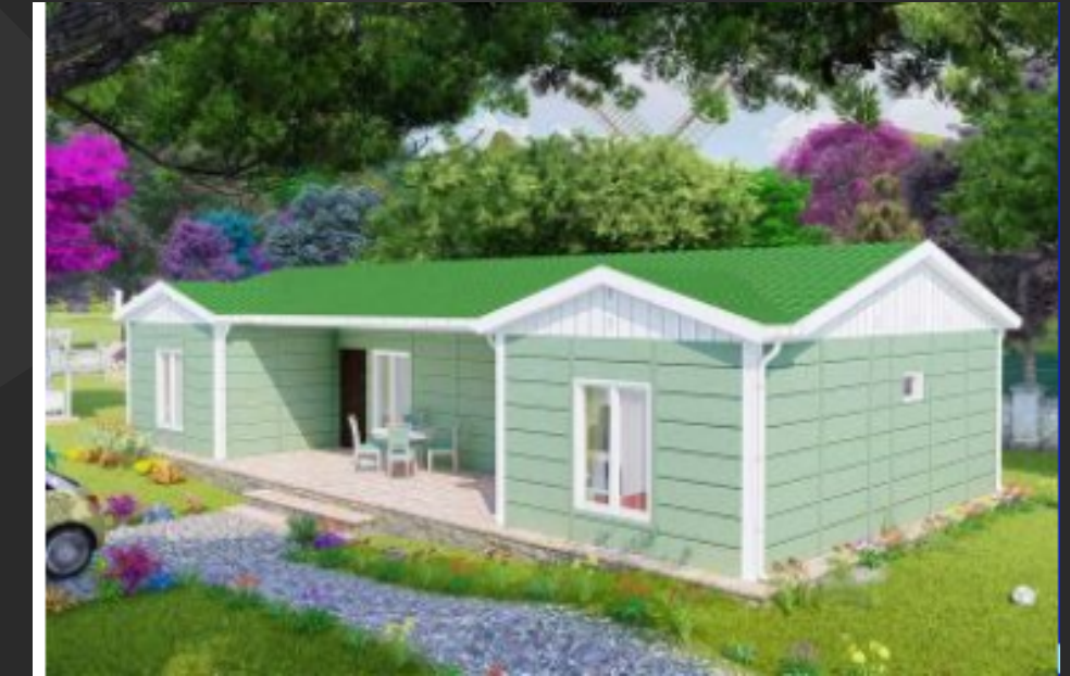
AYGNC GRAND 102

97 m 2 • 3+1 • Galvanized Steel • Fireproof Wall Panels • Sloped Roof Design • Laminate Flooring • High Thermal Efficiency