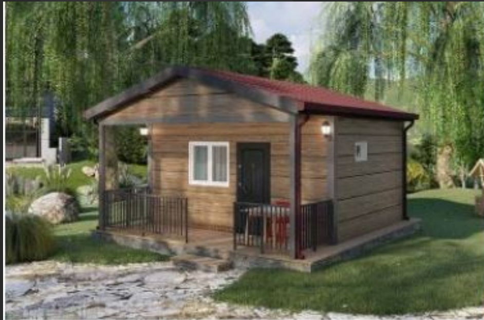
AYGNC COMPACT 28