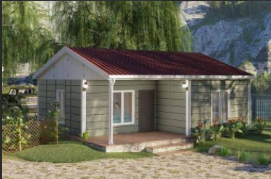
AYGNC COMFORT 64