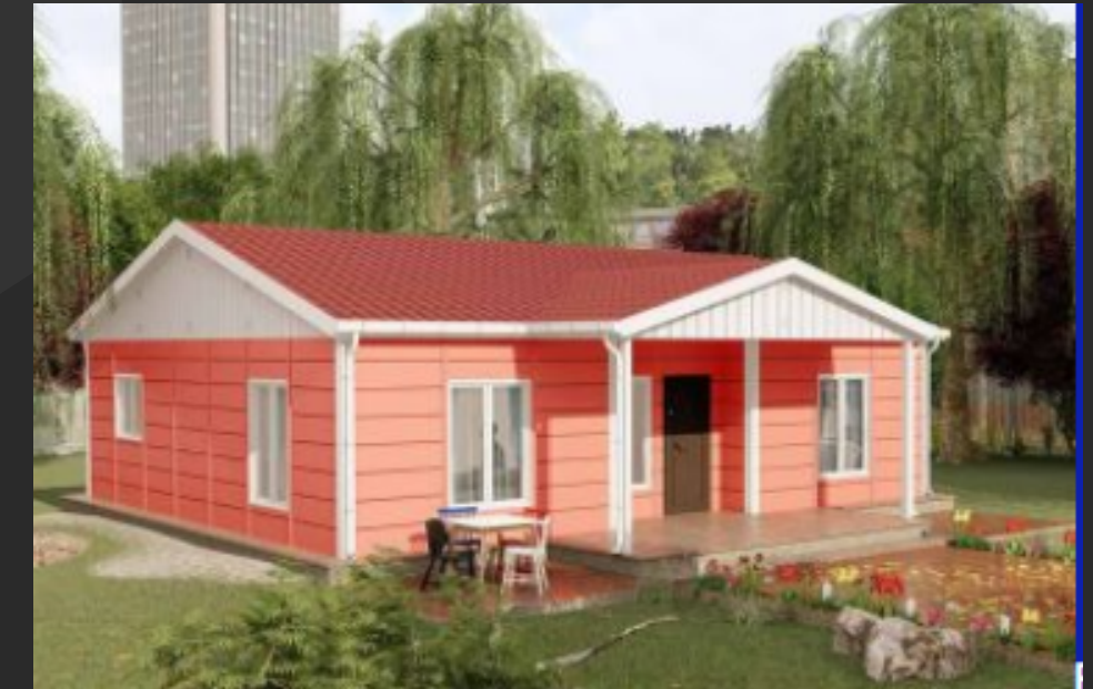
AYGNC VILLA 100

87 m 2 • 3+1 • Galvanized Steel • Modern Roof • EPS + Rock Wool Panels • Ceramic Flooring