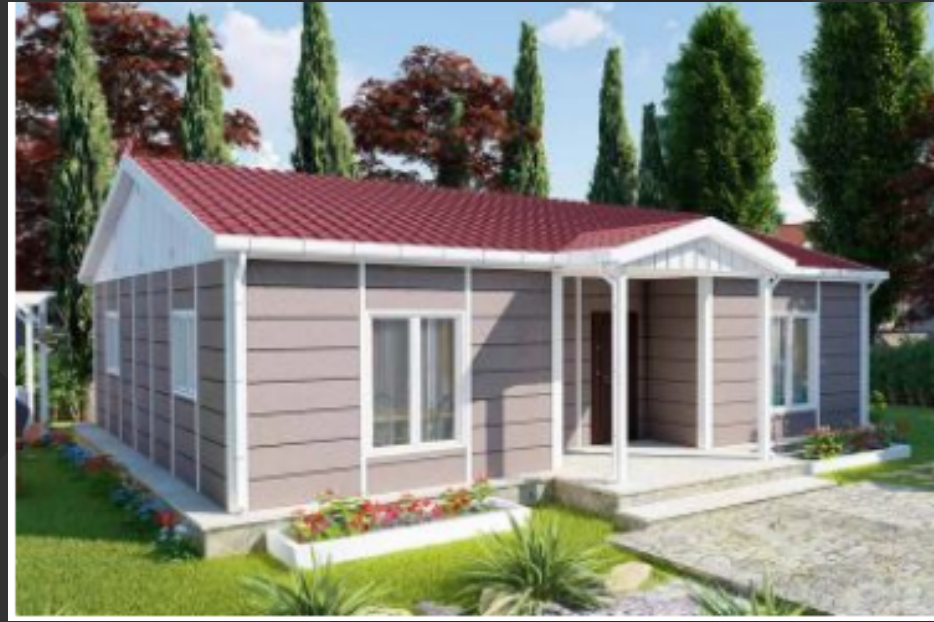
AYGNC COMFORT 97

95 m 2 • 3+1 • Steel Frame System • 13 cm Wall Panels • Insulated Roof • PVC Double-Glazed Windows • Modern Bathroom Fixtures