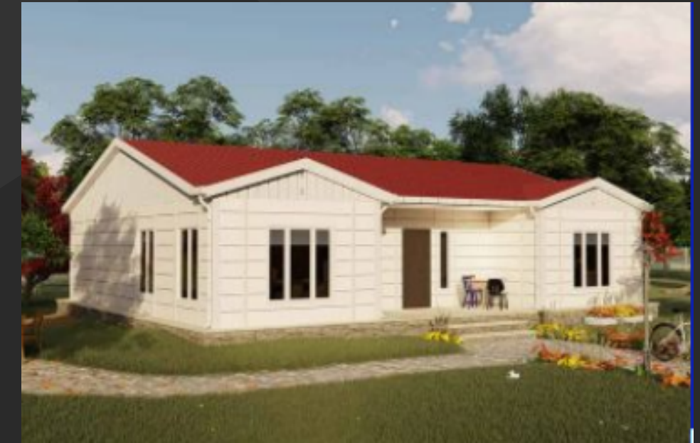
AYGNC LUXURY 126

123 m 2 • 3+1 Duplex • Reinforced Steel Structure • 2.8 m Ceiling Height • Balcony • Decorative Facade • Ceramic Flooring