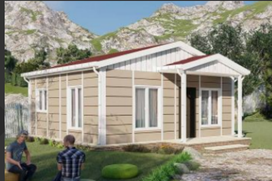
AYGNC FAMILY 45

28 m 2 • 1 Room • Galvanized Steel Frame EPS Insulated Panels • PVC Windows • Laminate Flooring