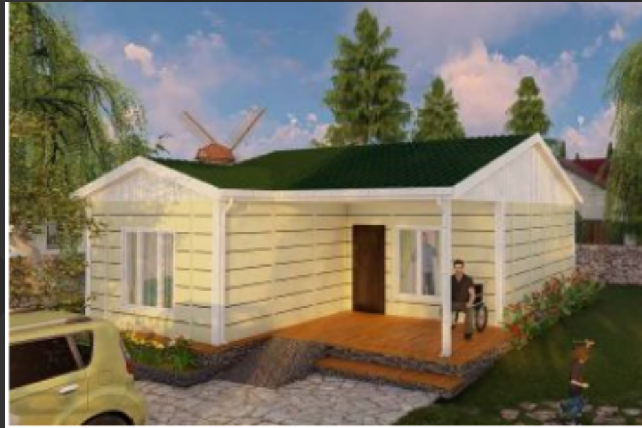
AYGNC RESIDENCE 73

64 m 2 • 3 Rooms • Steel Frame • Rock Wool / EPS Insulation • Sloped Roof • French Front Windows